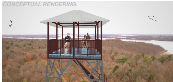
Proposition 3: Keystone Ancient Forest Observation Platform