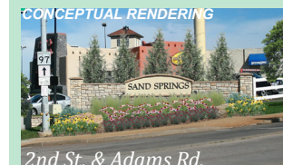
2nd St. & Adams Rd.