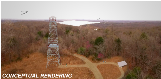
Proposition 3: Keystone Ancient Forest Overlook Tower