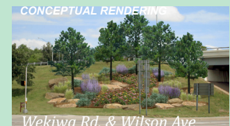
Wekiwa Rd. & Wilson Ave