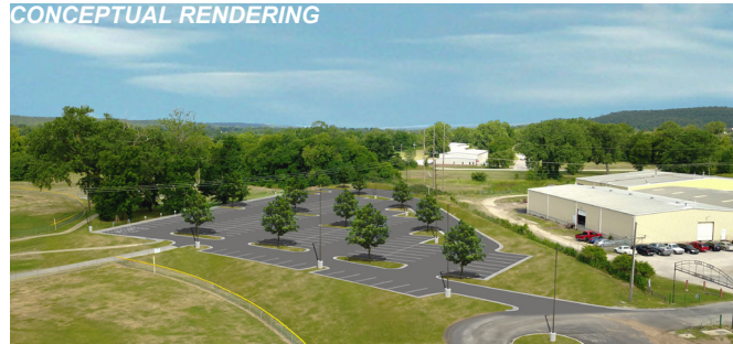
Proposition 3: Case Community Park Baseball Parking