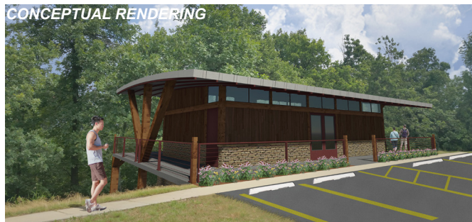
Proposition 3: Keystone Ancient Forest Visitor's Center