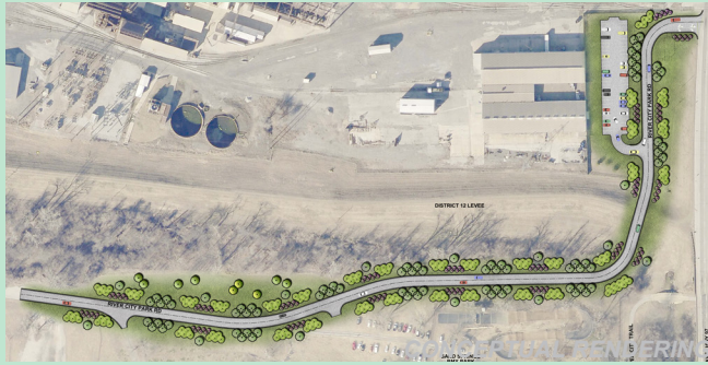
Proposition 1: Roadway over Levee to Case Community Park