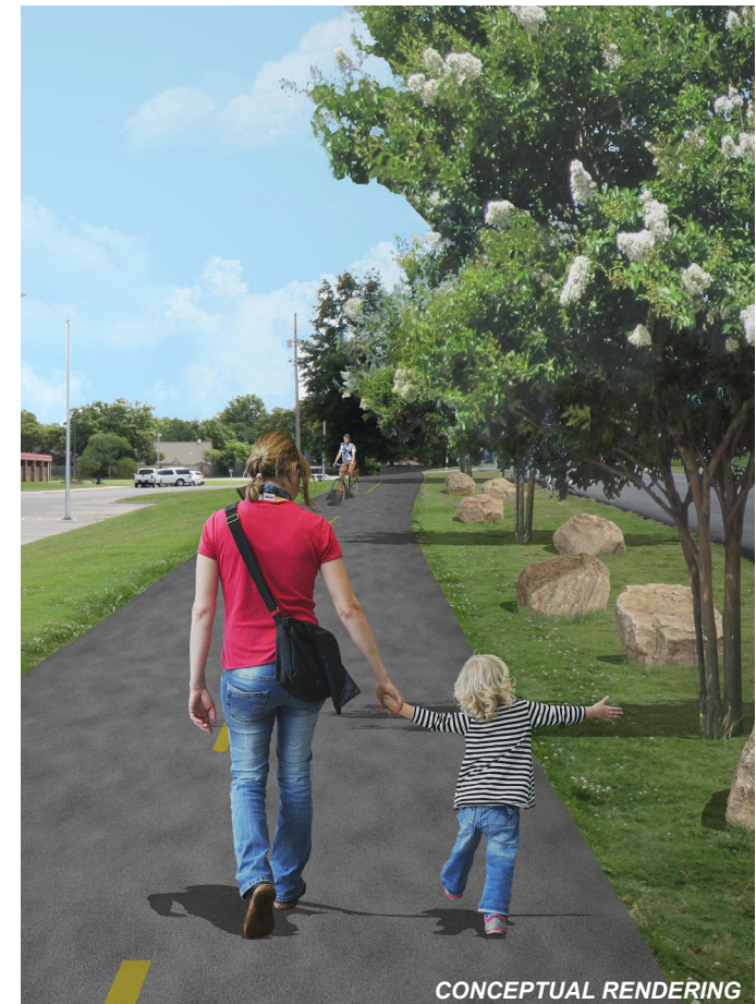
Proposition 3: Neighborhood Trails Improvements